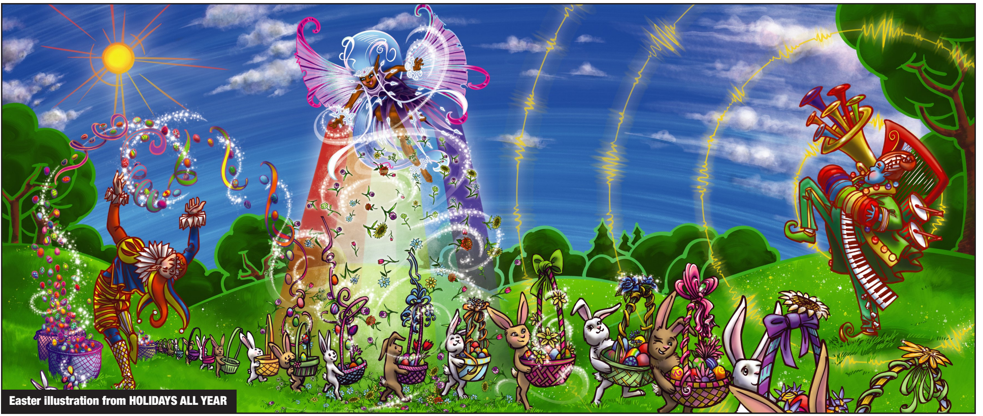
Easter illustration from HOLIDAYS ALL YEAR