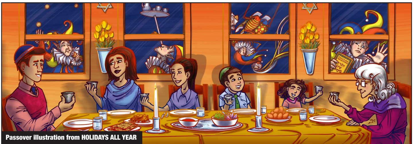
Passover illustration from HOLIDAYS ALL YEAR

ditions with enlightening, charismatic and culturally diverse adventures.