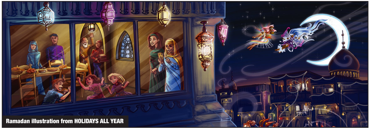
Ramadan illustration from HOLIDAYS ALL YEAR

In HOLIDAYS ALL YEAR, best friends POMP, SNOW & CIRQUEumstance wrap up their Christmas triumphs and find unique ways to share their music, magic and circus skills with holiday celebrations around the world, including Lunar New Year, Ramadan, Diwali, Passover, Easter, St. Pat's, Mardi Gras, Halloween and more. They set out to brighten holidays all year by celebrating time-honored tra-